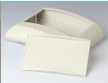
Clip-in Display Panel