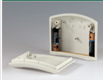
Battery Mounting (Size S)