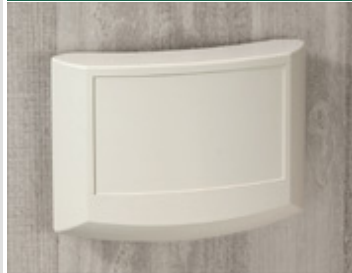
On The Wall