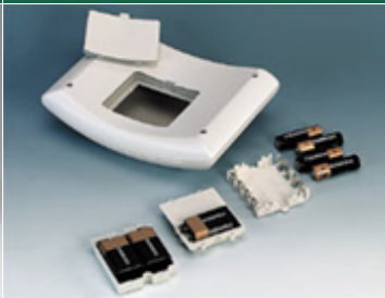
Battery Cradles (Size M&L)