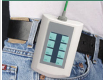
On Your Belt