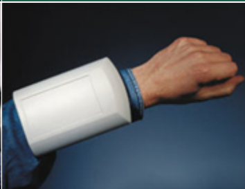
On Your Arm